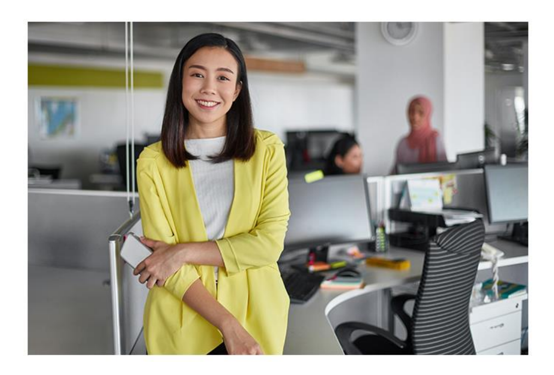
2. The price tag? Don't sweat it!